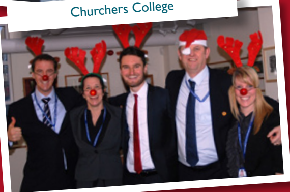
House and out in the community.