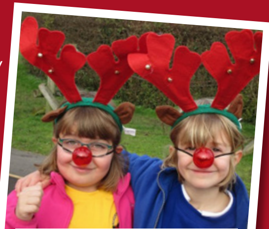
Boxgrove Primary School