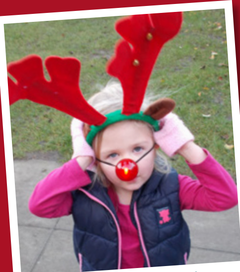
Arun Community Church Nursery

The amount raised is amazing. £30,000 is enough to pay for over four days of all care our services, both at the House and out in the community.